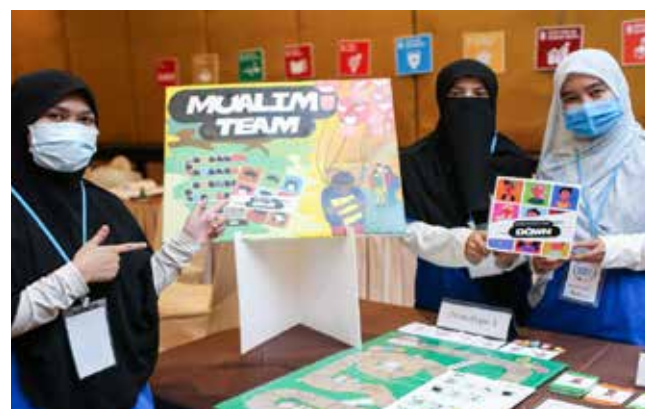
As part of Generation Unlimited, a team of students from Fatoni University in Pattani province nurture the peaceful dialogue skills among children from an early age. Through surveys with teachers and parents, they found that textbooks and workshops on bullying prevention are often not age appropriate for primary school children, who are likely to lose focus.