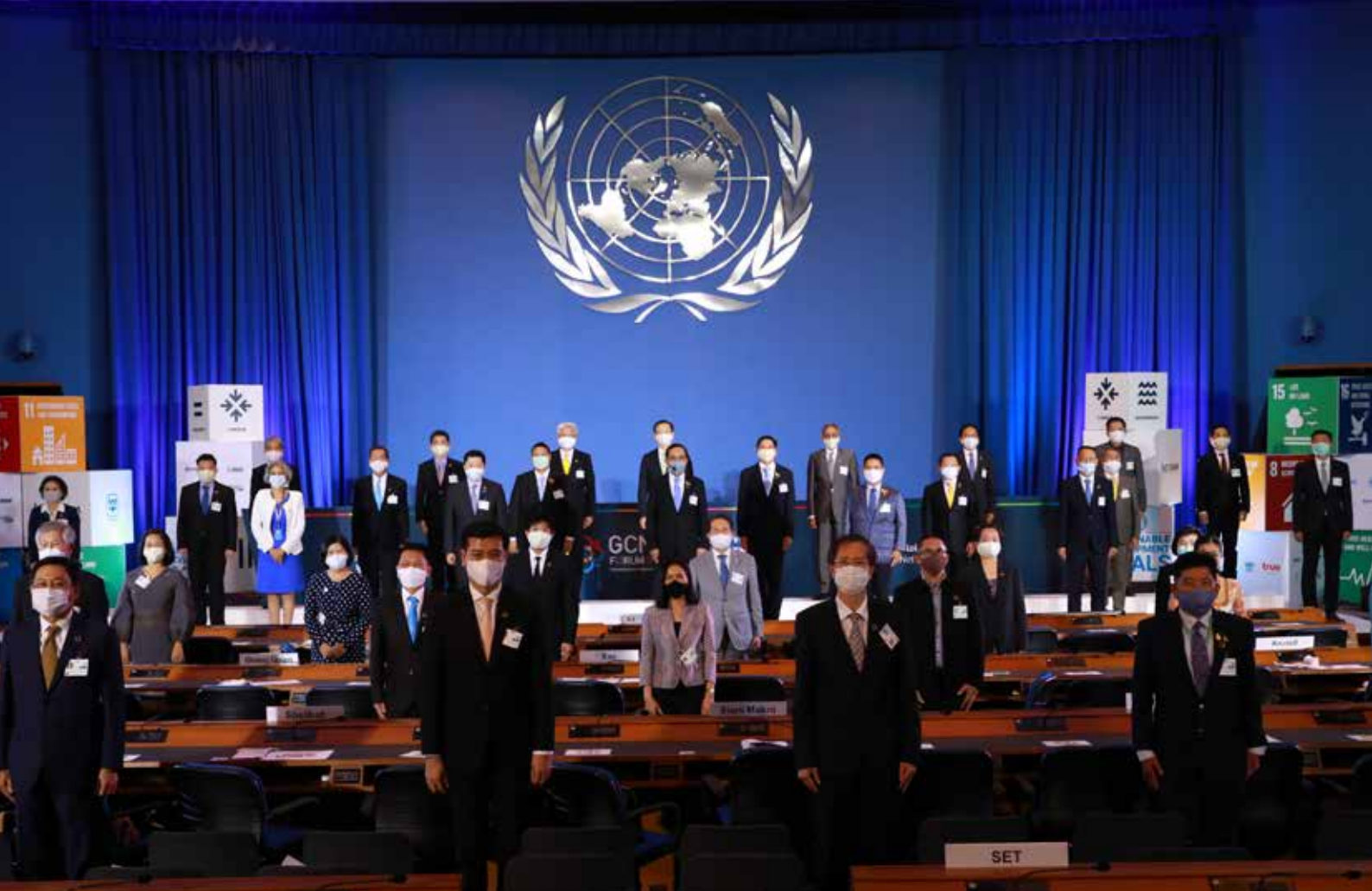
Business leaders show commitment to lead Thailand towards the Sustainable Development Goals at the 'GCNT FORUM 2020: Thailand Business Leadership for SDGs' in August 2020.

including South-South and Triangular Cooperation, the Gender Scorecard, Youth and Partnerships. The UNCT and Thailand International Cooperation Agency completed an analysis this year to inform the UN's South-South and Triangular Cooperation approach by assessing current interventions, existing gaps and how to best bridge them through a collaborative approach in the next Cooperation Framework.