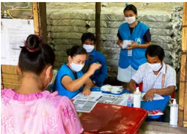
UNHCR staff distribute cloth face masks to Myanmar refugees in the Ban Don Yang Temporary Shelter.

UNHCR's advocacy for expanded alternatives to detention resulted in a 30-per-cent reduction in detention of urban asylum-seekers and refugees and an increase in those released on bail. Nearly 8,000 stateless persons received counselling services and assistance for nationality applications. UNHCR also continued to strengthen the capacity of hundreds of immigration officers on the national screening mechanism and other good immigration practices, contributing to Thailand's commitment to the Global Compact on Refugees.