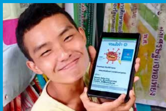
A non-formal education student of Mae Ki Community Learning Center reads the COVID-19 comic book on the LearnBig app. The student joins the “Learning Coin for Equitable Education” project implemented by UNESCO, Equitable Education Fund and Office of the Non-Formal and Informal Education, promoting good reading habits of marginalized children while allowing them to financially support their family based on their reading efforts. (Mae Ki, Mae Hong Son/ September 2020)

of Chulalongkorn University's Faculty of Education, together with the Mercy Centre, Foundation for the Better Life of Children and True Corporation.