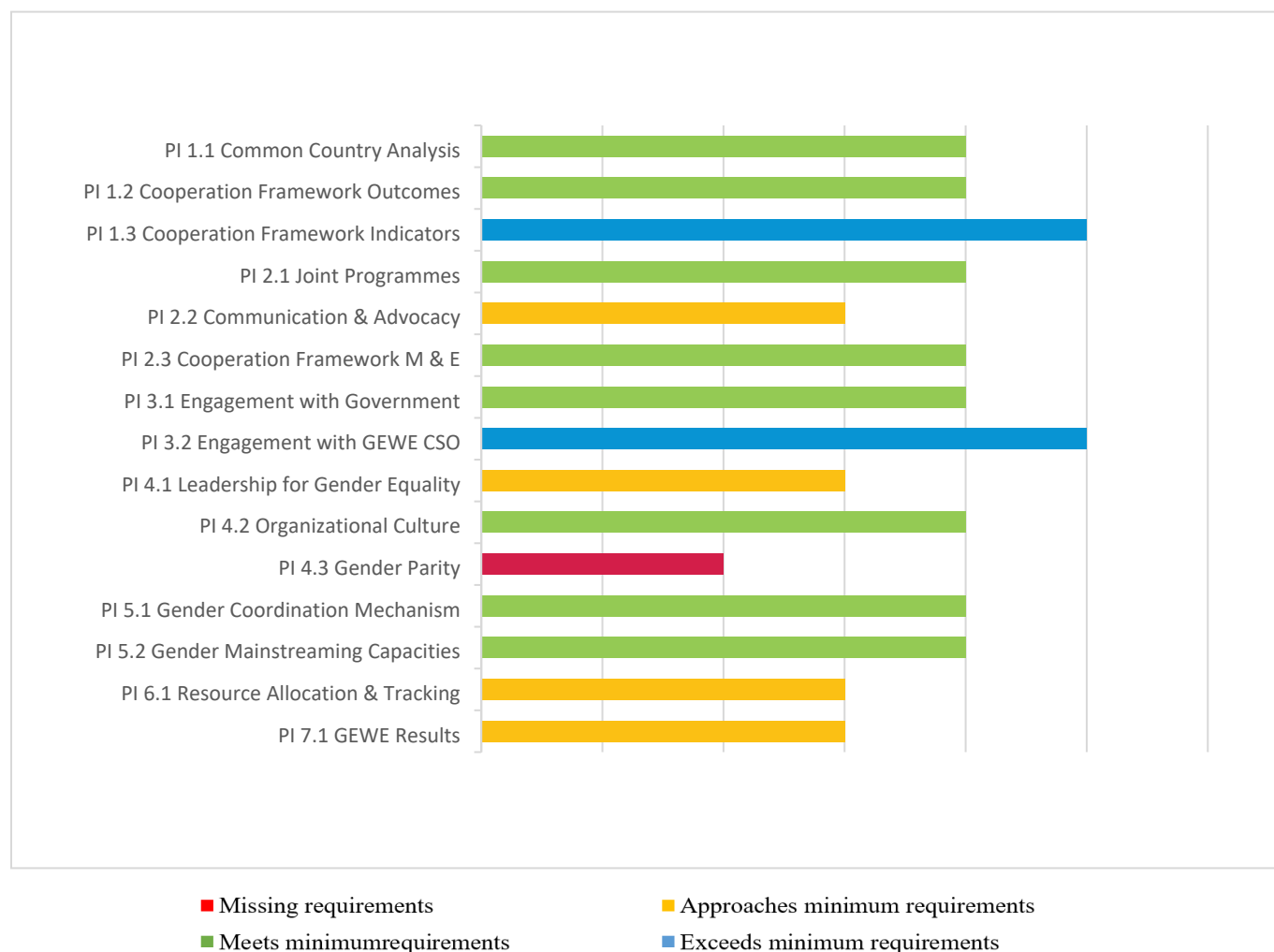
Table 2: Overview of UNCT-SWAP Cumulative Results in 2022

The findings presented in the below table indicate the ratings scored by the UNCT in Niger for each Performance Indicator across the seven dimensions of analysis as they stand in 2022. It includes the ratings reassessed in 2022, and ratings carried from previous reporting years.