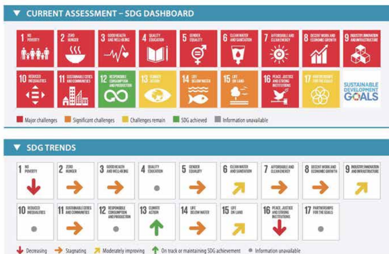
Figure 1: SDG Performance in Nigeria, 2020

Although Nigeria has made considerable progress towards attaining the SDGs, the country is still not on track to meet the 2030 Agenda (see Figure 1 above). Most of the SDGs are either stagnating or worsening, while just three are moderately improving. There are also significant data gaps for some SDGs that make analysis difficult. Accelerated efforts are required across the board if Nigeria is to make progress towards the 2030 Agenda.